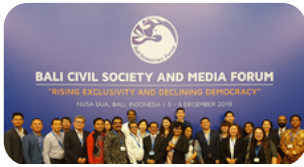
10th Workshop & Bali Democracy Forum (2019, Bali)