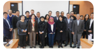
4th Workshop (2017, Taipei)

ADRN membership expanded to nineteen institutions and saw increasing interest and solidarity from our membership.