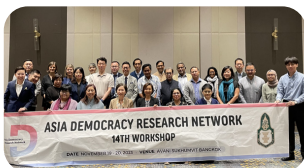
14th Workshop (2023, Bangkok)