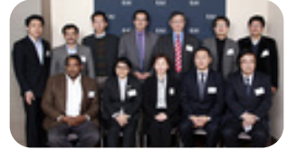
1st Workshop (2013, Seoul)

ADRN was founded in November 2013 with nine members, and held its first workshop in South Korea.