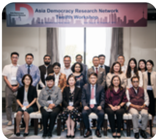
12th Workshop (2022, Seoul)