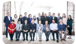
8th Workshop (2018, Seoul)

ADRN reaffirmed its solidarity as every partner member was represented on-site. ADRN further developed its relations with the Asia Democracy Network, jointly discussing and preparing for the workshop with the goal of "Going Forward Together."