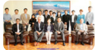
3rd Workshop (2016, Ulaanbaatar)

ADRN invited observers from think tanks in fledgling democracies, diversifying ADRN's voice and enriching its collective perspectives on Asian democracy.