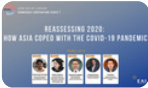
ADRN Online Seminar “Democracy Cooperation” Series