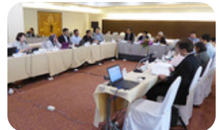
7th Workshop (2018, Bangkok)

Populism in Asia was selected as the first research topic for all members. Notable public discourses were made at national level as members engaged with governments and lawmaking bodies. ADRN also welcomed two new members—Indonesia and Japan.